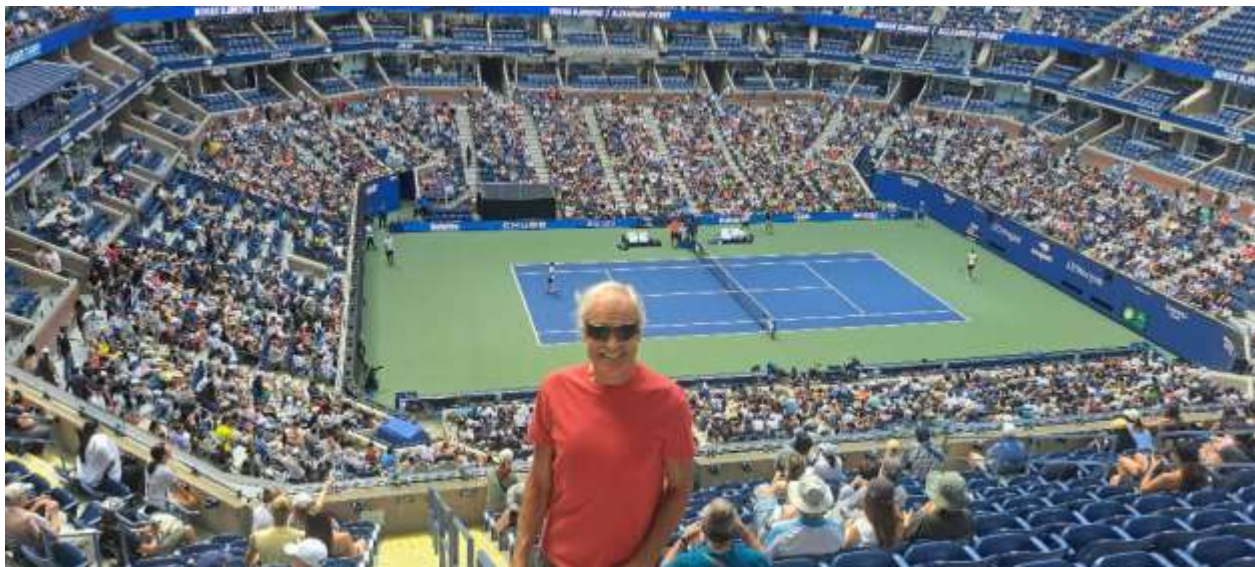
US OPEN 2024 – Arthur Ashe Stadium - Fresh Meadows, Queens practice session: Novak Djokovic plays with Alexander Zverev

PACT'24 – Meeting #23 Thursday, August 22, 2024 8 – 9:19 PM EST